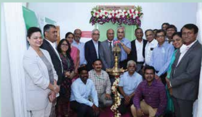
Team BG Road along with the senior leaders