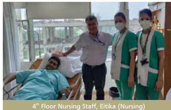
4 th Floor Nursing Staff, Eitika (Nursing)

Patient was extremely happy with the services and gifted a sweet box to the nursing staff on the day of his discharge.