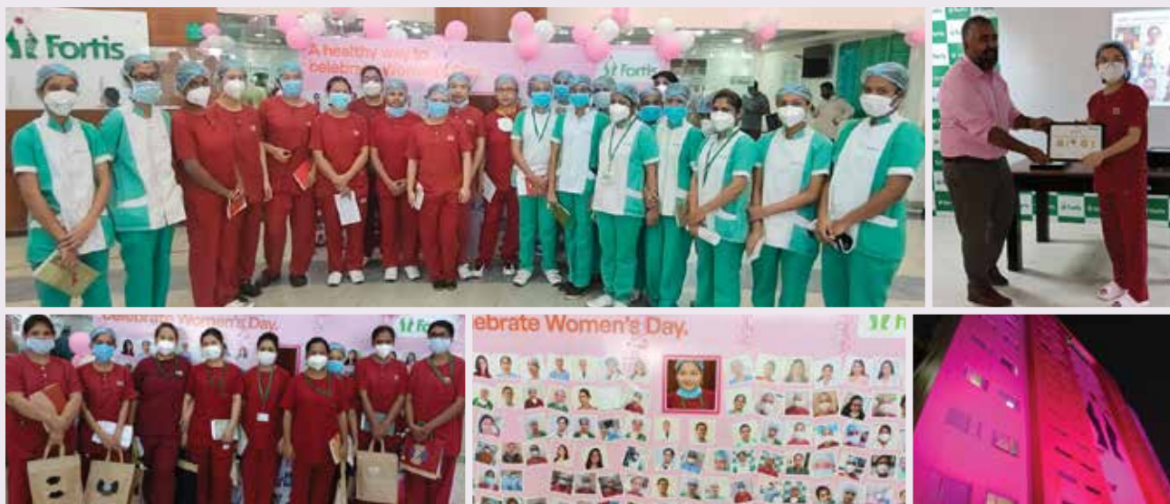
Glimpses of the celebration at Fortis Hospital, Anandapur, Kolkata

Celebrating this year's theme of 'Gender equality today for a sustainable tomorrow', International Women's Day was held at Fortis Hospital, Anandapur, Kolkata on 8th March, 2022.