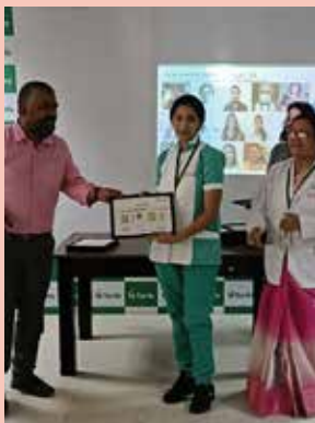
Fortis Hospital, Anandapur