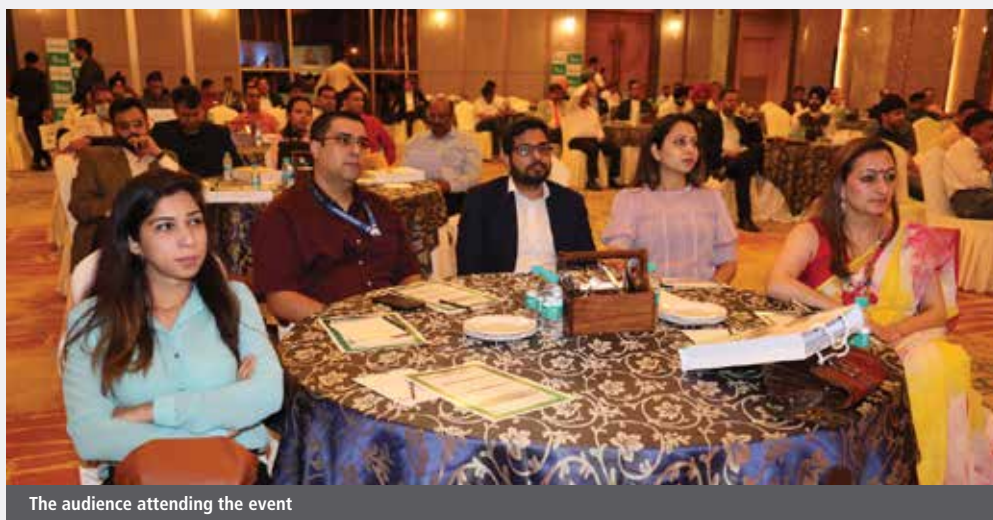
The audience attending the event

After a series of successful events in Delhi, Chennai, Kolkata, Bangalore and Mumbai, the sixth edition of HR Conclave was organised by Fortis Hospital, Mohali, on April 22, 2022. The conclave was attended by over 200 HR professionals, including Chief HR Officers, HR Directors and CEOs from leading corporates of the Tricity who shared their views on 'Reinventing Role of HR in the New Normal-2022'. Three panel discussions were held on