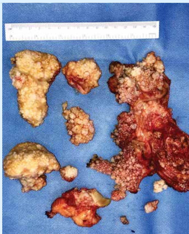
The stones removed from the patient's knee