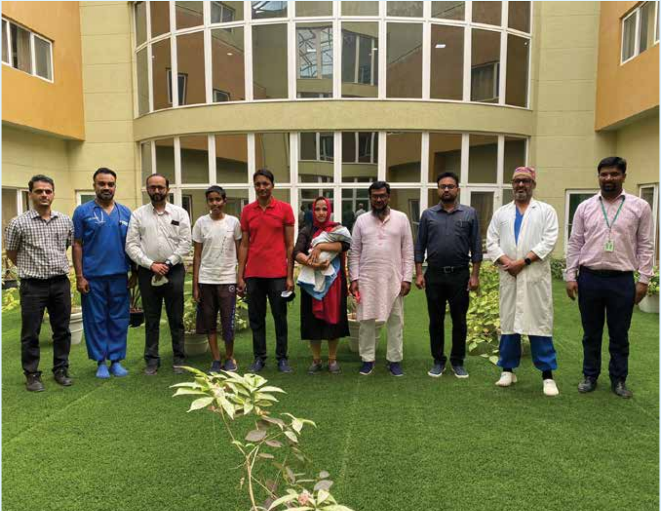
Liver transplant patient along with the team of doctors and staff