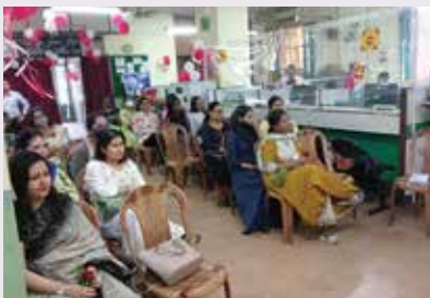
Health talk in progress