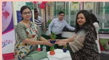
Fortis Hospital & Kidney Institute, Kolkata