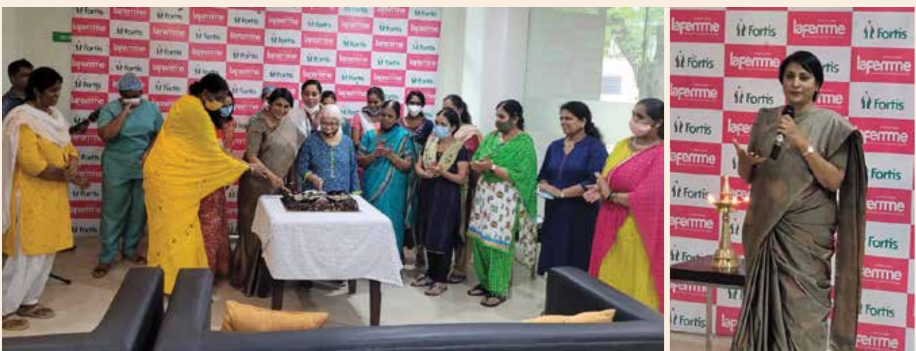
Celebrating Mother's Day