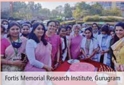
Fortis Memorial Research Institute, Gurugram