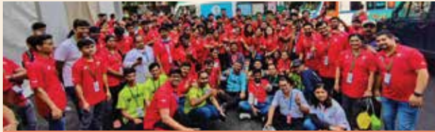
Fortis team present at the marathon