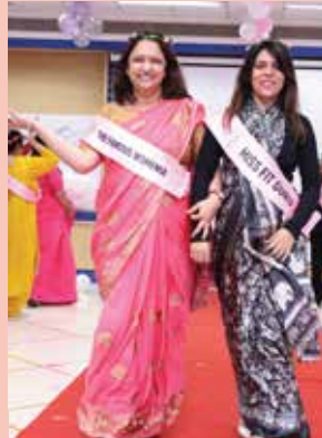
Fortis Hospital, Mohali