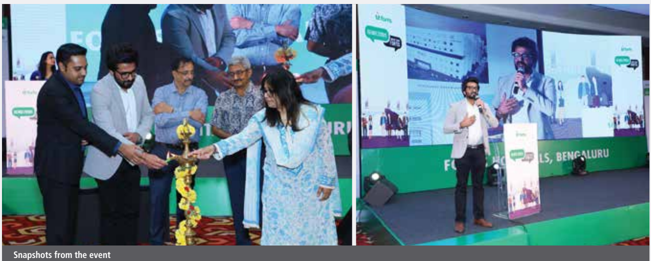
Snapshots from the event

'Rendezvous with Team Fortis', an event for networking with Public Sector Enterprises and Govt. Institutions, is a platform where who's who from the PSUs are present and key clinicians & ZDs/FDs from our units are available for networking. After the success of this event in Delhi NCR and Kolkata, the Domestic Sales Team had organized the third edition of 'Rendezvous with Team Fortis' event in Bengaluru on April 22, 2022. The event attracted over 250 representatives from over 66 PSUs and Govt. Institutions. This platform promotes interaction amongst the leadership and doctors of PSUs as well as senior leadership and key consultants from our units.