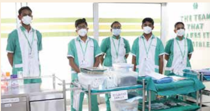
Trolley set-up at the conference