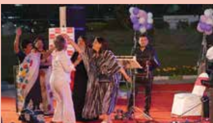
Fortis La Femme, GK-II