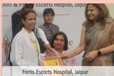
Fortis Escorts Hospital, Jaipur