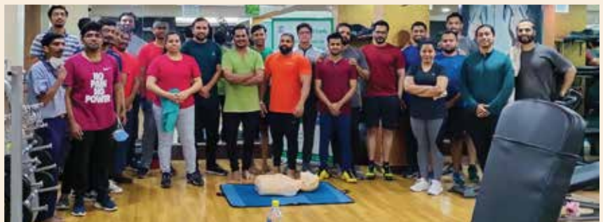
Fitness enthusiasts undergoing Basic Life Support training

Fortis Hospital, Rajajinagar, Bengaluru, conducted a Basic Life Support session at a gym on March 16, 2022. The session commemorated the birthday of Mr Puneet Rajkumar, the popular cine actor who passed away last year after a sudden cardiac arrest. As part of the session, 40 members of the gym received hands-on education using mannequins about handling a medical emergency. They were also apprised of the mindset required to address the situation and were trained on how and whom to call for help.