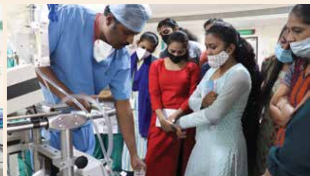
Workstation set-up at the conference