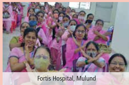
Fortis Hospital, Mulund