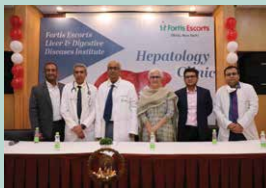
Glimpses of the inauguration ceremony