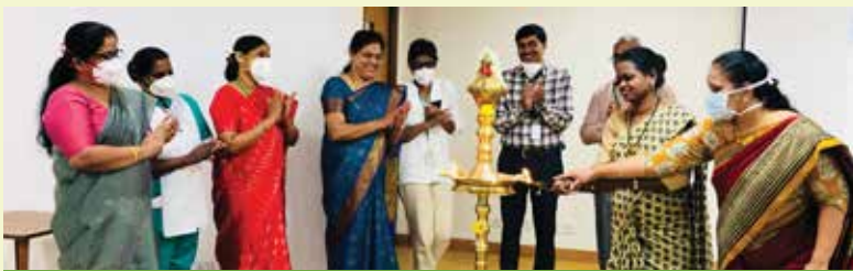
Lamp lighting by the leaders