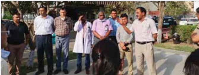
Brief by Civil Defence Team