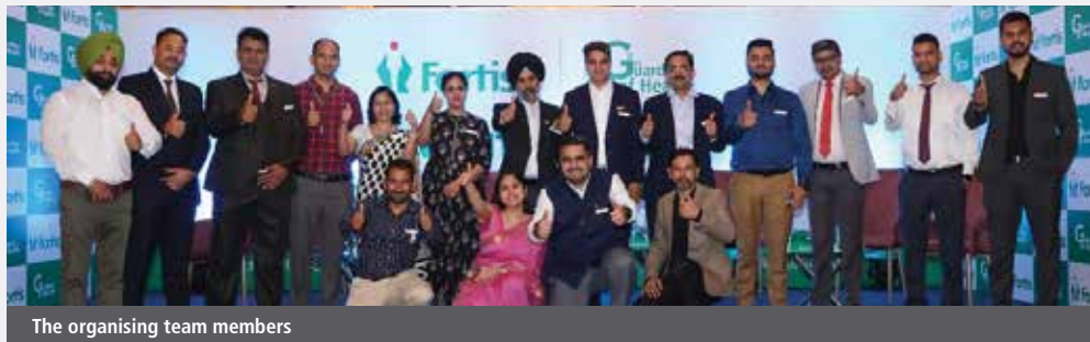
The organising team members