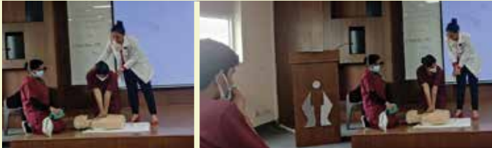
The training session in progress