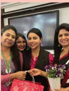
Fortis Ft Lt Rajan Dhall Hospital, Vasant Kunj

Fortis Celebrates International Women's Day 2022