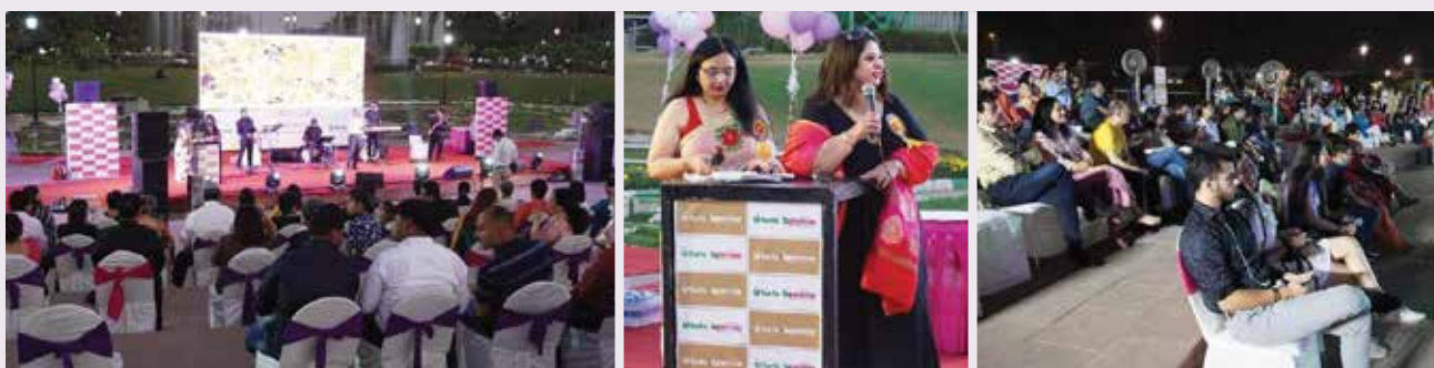
The event was hugely appreciated by the audience

Fortis La Femme GK II, New Delhi, celebrated International Women's Day with a unique event, titled 'Saviours become Performers.' The fun-filled event for the medical fraternity comprised of a musical evening wherein the doctors gave performances. The event saw participation from more than 400 doctors from various healthcare organisations in the city. The theme of the event was #breakthebias and was held at Amphitheater, Connaught Place, Central Park, New Delhi.