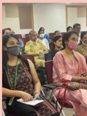
Fortis Hospital BG Road, Bengaluru

Fortis Celebrates International Women's Day 2022