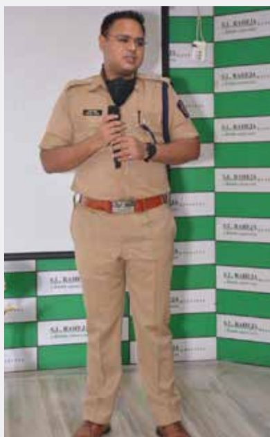
Shri Pranay Ashok, Deputy Commissioner of Police (Zone 5) addressing the attendees during program inauguration