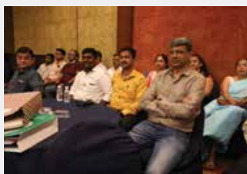
Fortis Hospital, Mulund's Fortis Priority Partner Meet in progress