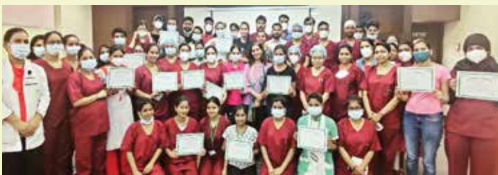
The participants of the Advanced Cardiac Life Support training