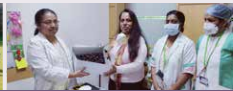
Celebrations at FMRI, Gurugram

On the occasion of International Women's Day, Fortis Memorial, Gurugram was lit up in purple colour which signifies dignity and justice. The hospital celebrated the occasion by arranging a get together with fun filled games and a cake cutting ceremony for its female workforce.